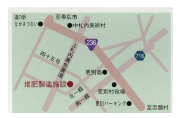
Figure 2. Location of compost facility