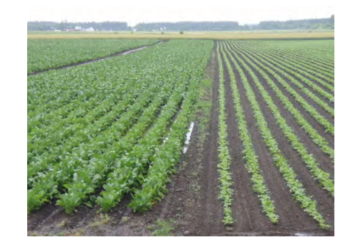
Ootebou and Sugar beet