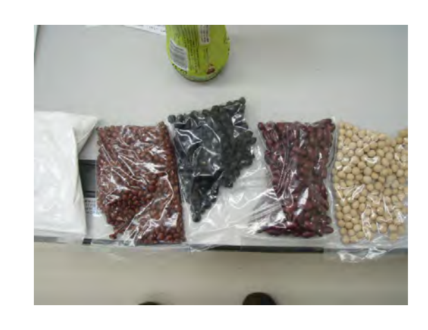
Starch and beans