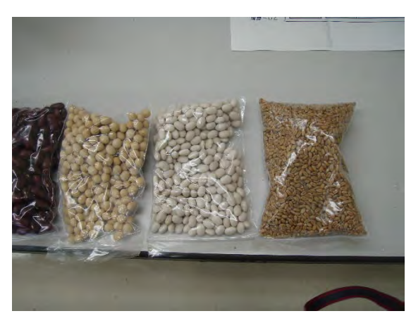
Beans and Wheat

Sugar beet and potato (still small in July)